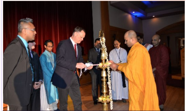
Religious dignitaries and invitees lighting the oil lamp to mark the start of the ceremony

As usual, kids put out a wonderful concert of dances