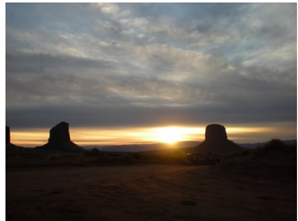
The Monument Valley (2011, USA): Glorious End