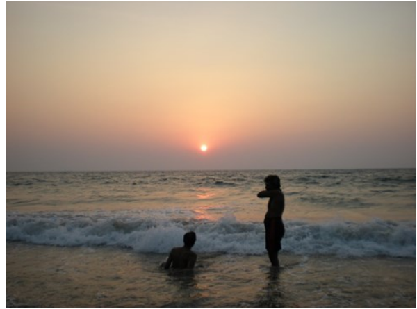
The Indian Ocean (2010, Sri Lanka): Bathing Brothers