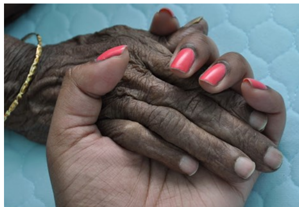
(Photo was taken by a Sri Lankan Australian while visiting her Grandmother in Sri Lanka. It was downloaded from her Blog)